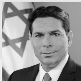
Danny Danon Former Ambassador of Israel in the United Nations